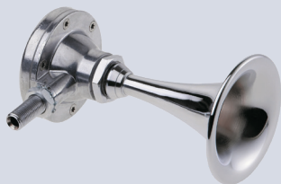
Article No. 2500.04 with 1 diaphragm acoustic horn 150 mm long, tuned a" (880 Hz)

Air consumption: approx. 25 l/min. at 0.5 bar | approx. 75 l/min. at 1.0 bar