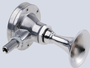
Article No. 2501.04 with 1 diaphragm acoustic horn 105 mm long, tuned d" (1174 Hz)