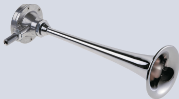
Article No. 2504.04 with 1 diaphragm acoustic horn 315 mm long, tuned a" (440 Hz)