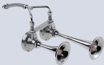
Article No. 2511.04 with 2 diaphragm acoustic horns 227 mm and 156 mm long tuned d", g" (587, 784 Hz)

Air consumption: approx. 35 l/min at 0.5 bar | approx. 100 l/min at 1.0 bar