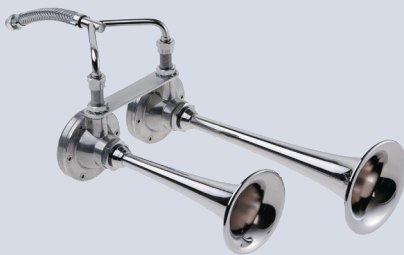
Article No. 2512.04 with 2 diaphragm acoustic horns 295 mm and 227 mm long tuned b", d" (466, 587 Hz)