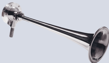
Article No. 2505.04 with 1 diaphragm acoustic horn 346 mm long, tuned g" (392 Hz)